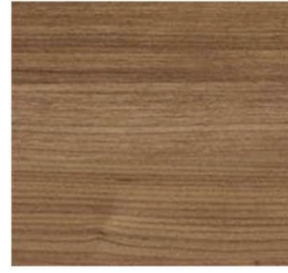
RIVER CHERRY (42)