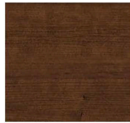
TRADITIONS CHERRY (02)