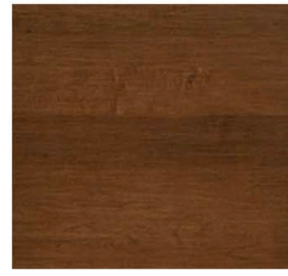
FARM MAPLE (22)