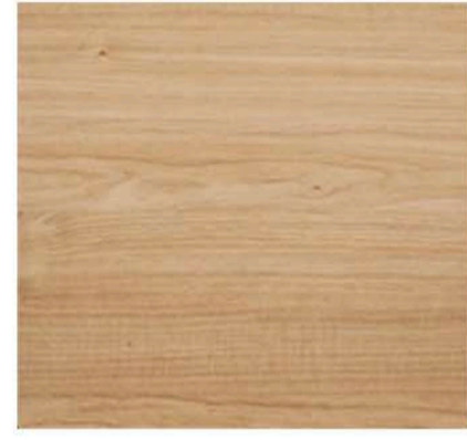
NEW NATURAL MAPLE (23)*