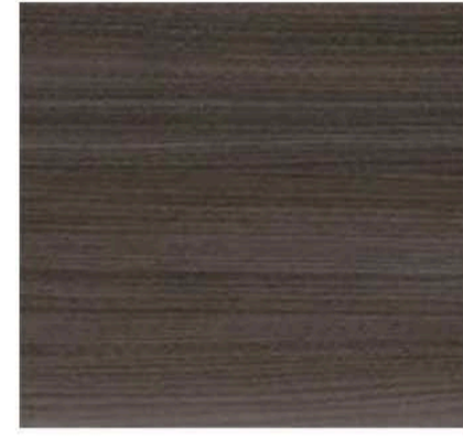
RODEO OAK (20)