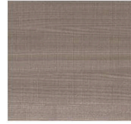
SALT OAK (19)