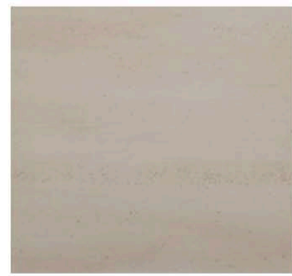
WEATHERED WHITE (03)