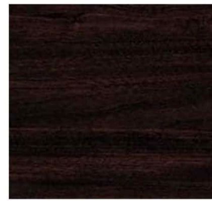
VERMONT MAPLE (17)