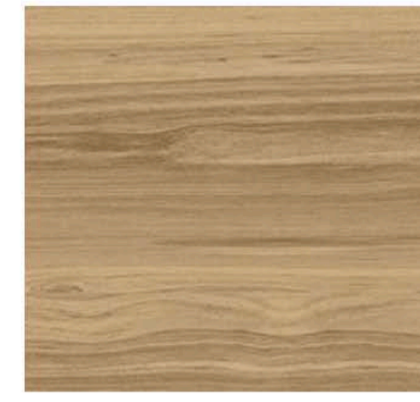
FAWN CYPRESS (33)