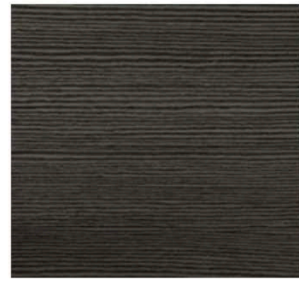
EBONY ASH (21)